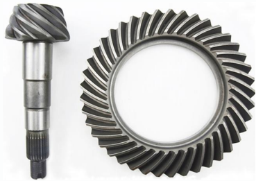
TOYOTA 9/41 41201-29536 5.08KG