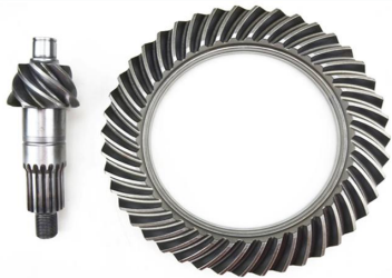
ISUZU 7/43 897320103-0 10.4KG