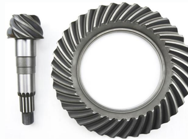
MITSUBISHI PS100 6/37 MB005252 12.52KG